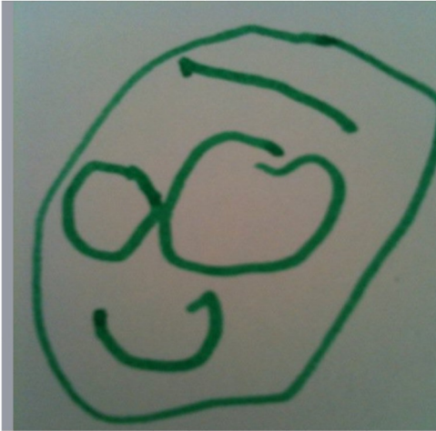
Zack drew a picture of Daddy Ink, the likeness is uncanny! ☺

Zack drew a picture of Daddy Ink!!! The likeness is uncanny!!!